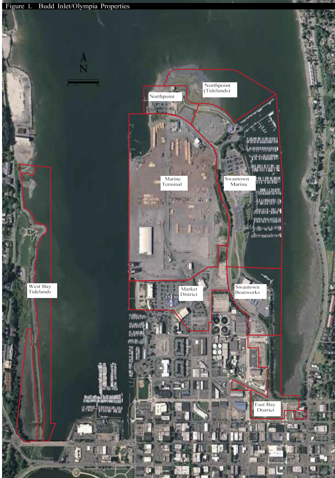
Figure 1. Budd Inlet/Olympia Properties